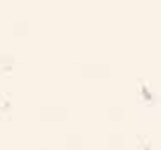
たまごクッパまたはスープ Egg Porridge or Soup