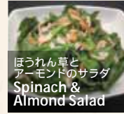
ほうれん草とアーモンドのサラダ Spinach & Almond Salad