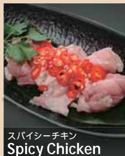
スパイシーチキン Spicy Chicken