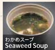
わかめスープ Seaweed Soup

*Tuna flake topped w/ mayonnaise on rice