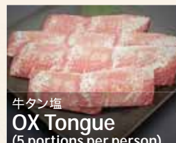
牛タン塩 OX Tongue (5 portions per person)

KOH-YA BUFFET + additional menu as follows + SPECIAL BUFFET