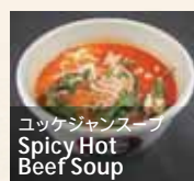
ユッケジャンスープ Spicy Hot Beef Soup