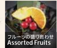
フルーツの盛り合わせ Assorted Fruits