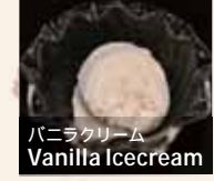
バニラクリーム Vanilla Icecream