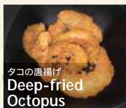
タコの唐揚げ Deep-fried Octopus