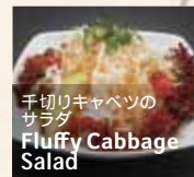
千切りキャベツのサラダ Fluffy Cabbage Salad