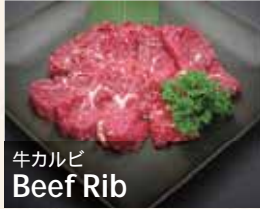
牛カルビ Beef Rib