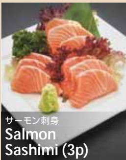
サーモン刺身 Salmon Sashimi (3p)