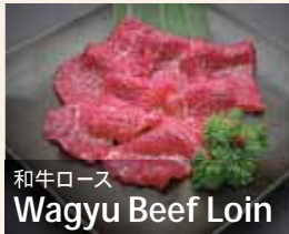
和牛ロース Wagyu Beef Loin