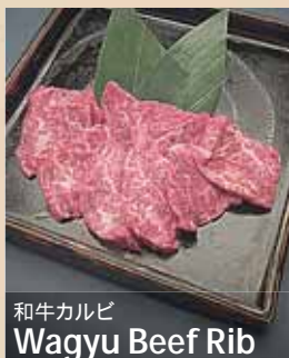
和牛カルビ Wagyu Beef Rib

*Cook lightly, then dip in lemon juice & chilli powder