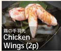
鶏の手羽先 Chicken Wings (2p)