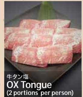
牛タン塩 OX Tongue (2 portions per person)

*Cook lightly, then dip in lemon juice & chilli powder