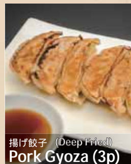
揚げ餃子 (Deep Fried) Pork Gyoza (3p)