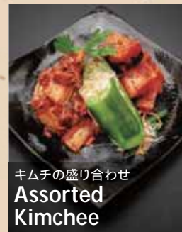
キムチの盛り合わせ Assorted Kimchee