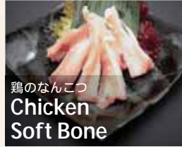
鶏のなんこつ Chicken Soft Bone