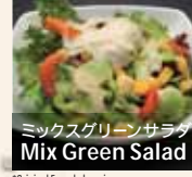
ミックスグリーンサラダ Mix Green Salad