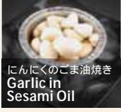
にんにくのごま油焼き Garlic in Sesami Oil