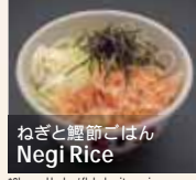
ねぎと鰹節ごはん Negi Rice