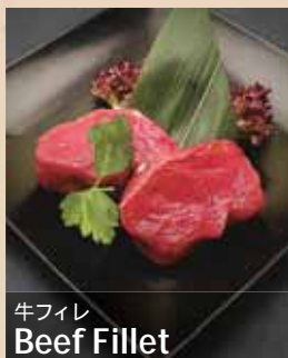
牛フィレ Beef Fillet