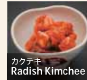
カクテキ Radish Kimchee