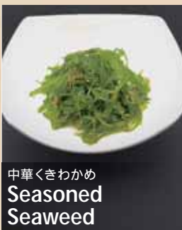
中華くきわかめ Seasoned Seaweed