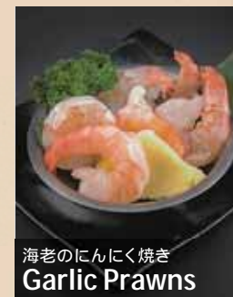
海老のにんにく焼き Garlic Prawns