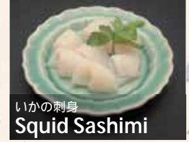
いかの刺身 Squid Sashimi