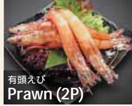
有頭えび Prawn (2P)