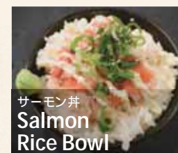
サーモン丼 Salmon Rice Bowl