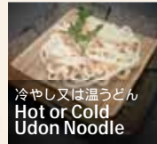
冷やし又は温うどん Hot or Cold Udon Noodle