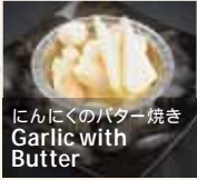
にんにくのバター焼き Garlic with Butter