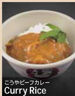
ごうやビーフカレー Curry Rice