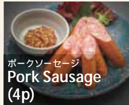
ポークソーセージ Pork Sausage (4p)