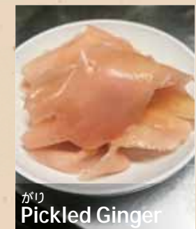
がり Pickled Ginger