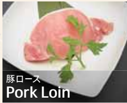
豚ロース Pork Loin