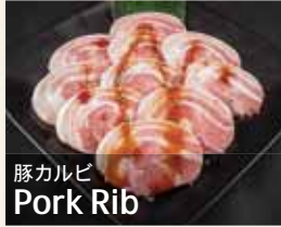
豚カルビ Pork Rib