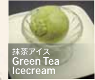
抹茶アイス Green Tea Icecream

*Baby bok choy & carrot, pickled radish & bean sprout, and shitake mushroom