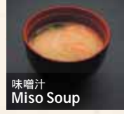
味噌汁 Miso Soup