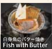
白身魚のバター焼き Fish with Butter