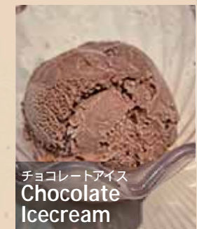
チョコレートアイス Chocolate Icecream