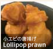
小エビの唐揚げ Lollipop prawn