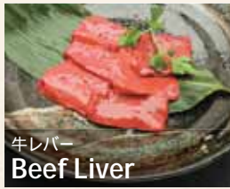
牛レバー Beef Liver