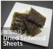
韓国のり Dried Seaweed Sheets