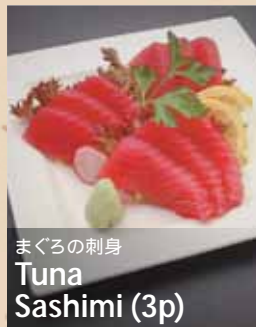
まぐろの刺身 Tuna Sashimi (3p)