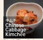
キムチ Chinese Cabbage Kimchee