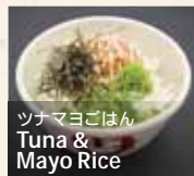
ツナマヨごはん Tuna & Mayo Rice

*Tuna flake topped w/ mayonnaise on rice