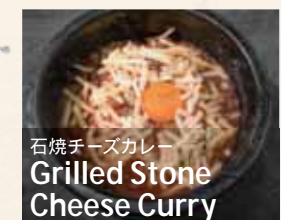
石焼チーズカレー Grilled Stone Cheese Curry