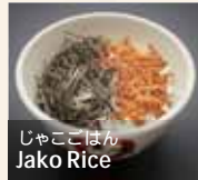
じゃこごはん Jakon Rice