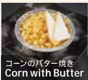
コーンのバター焼き Corn with Butter