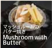
マッシュルームのバター焼き Mushroom with Butter