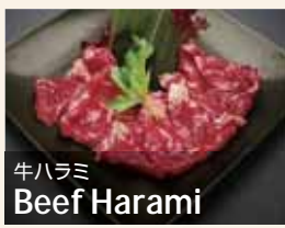
牛ハラミ Beef Harami