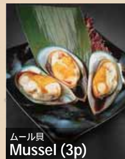
ムール貝 Mussel (3p)