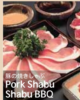
豚の焼きしゃぶ Pork Shabu Shabu BBO