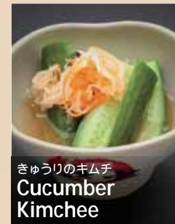
きゅうりのキムチ Cucumber Kimchee