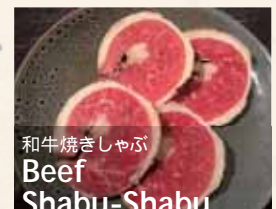
和牛焼きしゃぶ Beef Shabu-Shabu

*Cook lightly, then dip in lemon juice & chilli powder