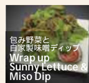
包み野菜と自家製味噌ディップ Sunny Lettuce & Miso Dip